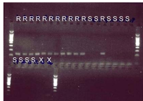
Fig. 2 PCR products obtained using the GMRes primers in phenotypically scored Ribes nigrum germplasm. A band is observed in resistant (R) accessions, with no amplification in susceptible (S) accessions. Germplasm used: top row from left 8944-4, 8986-13, 8982-6, Ben Finlay, 9311-82, 9328-45, 938-56, 934-74, 9311-66, 9199-4, B1834-120, 8942-5, 894-3, 8992-11, 8930-2, 8999-9, 8966-9, 896-4. Bottom row from left Ben Lomond, Ben Tirran, 9137-2, 9148-9. X empty lanes

In order to verify that the absence of a fragment was due to a lack of sequence homology and not simple amplification failure, another set of primers (mapped SSR) was used as controls, which amplified across all germplasm (Fig. 1).